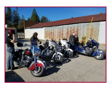
One group of bikes parking behind Dine & Dash.